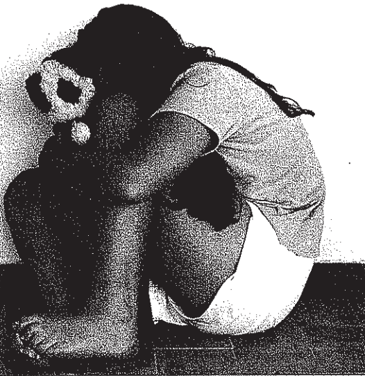
Intimate partner sexual assault is associated with more severe depression, anxiety, and behavior problems in the children of adult victims.