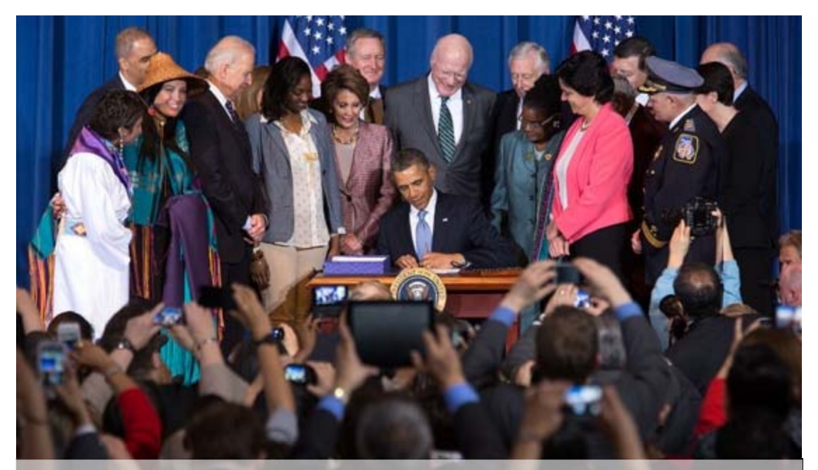
President Barack Obama signs S. 47, the "Violence Against Women Reauthorization Act of 2013," (VAWA) in the Sidney R. Yates Auditorium at the U.S. Department of Interior in Washington, D.C., March 7, 2013.

It is up to all of us to ensure victims of sexual violence are not left to face these trials alone. Too often, survivors suffer in silence, fearing retribution, lack of support, or that the criminal justice system will fail to bring the perpetrator to justice. We must do more to raise awareness about the realities of sexual assault; confront and change insensitive attitudes wherever they persist; enhance training and education in the criminal justice system; and expand access to critical health, legal, and protection services for survivors.