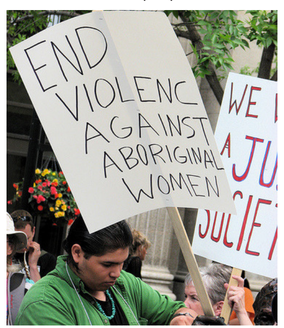
"Protecting the Circle" Aboriginal Men Ending Violence Against Women, Ryerson Student Campus Centre Toronto. www.nativeyouthsexualhealth.com/protectingthecircle.html

TRUTH: Sex and sexuality are way more complex than labels. If your first sexual experience was through a sexual assault, you still have the power to give yourself in the future on your own terms--you can decide who your first healthy experience will be with and when. These choices define you, not the assault. Violence never totally defines who we are as individuals or as Native peoples.