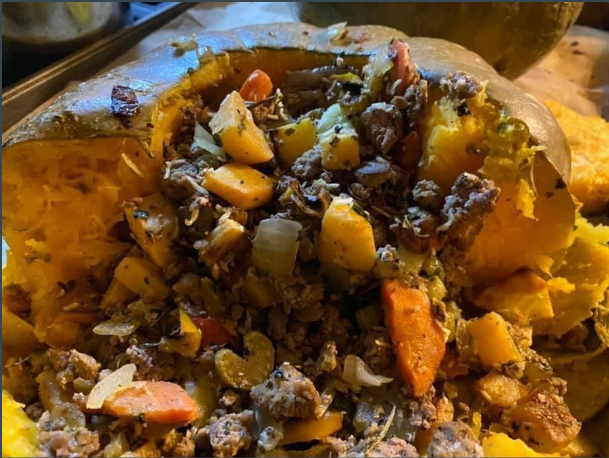
Indigenous Stuffed Squash