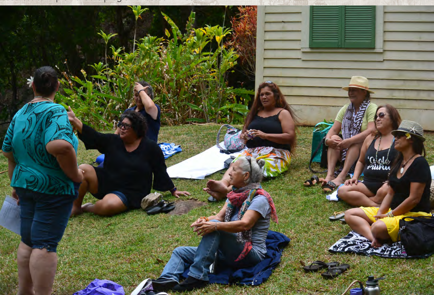
'Iao Valley, Maui, Hawaii, Sept. 2017: Pouhana O Na Wahine members discussing ho'oponopono, a Native Hawaiian spiritual practice for setting things right and peacemaking. Ho'oponopono continue to be an important practice in the organizing to bring healing from the overthrow of the Native Hawaiian monarchy and to end violence against Native Hawaiian women.

Important to note that the U.S. government entered into five treaties with the Kingdom of Hawaii as referenced in the Apology Bill from 1826 through 1887, and, has consistently recognized its legal relationship with the Native Hawaiian community with more than 150 federal laws, including creating special programs and services for the Native Hawaiian community. Examples include the Hawaiian Homes Commission Act, Native Hawaiian Health Care Improvement Act, and Native Hawaiian Education Act. There has also been a legal relationship as evidenced by state laws respecting Native Hawaiians. As written in the state Constitution Article 12, Section 7, reaffirming that the state "shall protect all rights, customarily and traditionally exercised...by... descendants of native Hawaiians who inhabited the Hawaiian islands prior to 1778."