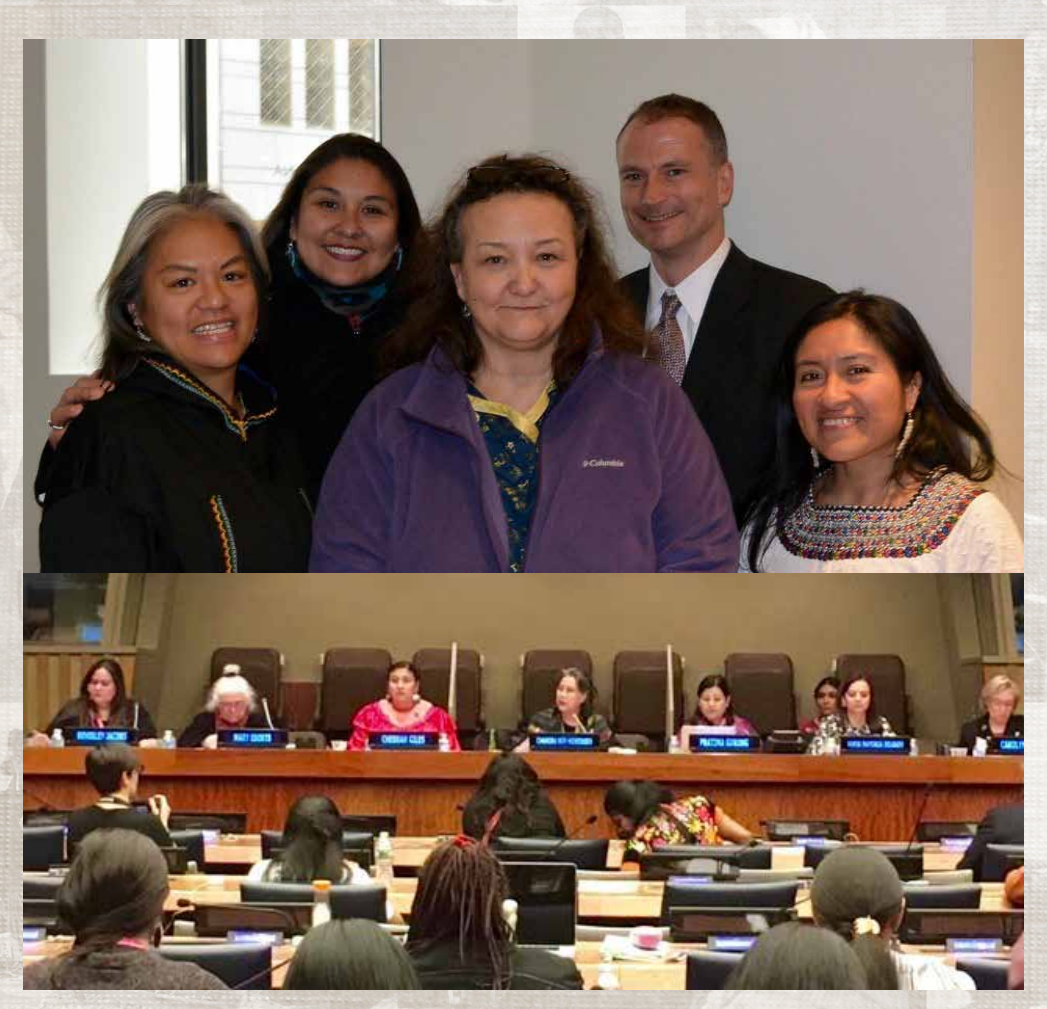
CSW61, New York City, March 15, 2017—The Alaska Native Women's Resource Center, the Indian Law Resource Center, the International Mayan League/USA, the Minnesota Indian Women's Sexual Assault Coalition, and the National Indigenous Women's Resource Center (NIWRC) hosted the CSW61 side event Ending Violence Against Indigenous Women as a Step Towards Empowerment.

The Commission will hold its 165th session in Montevideo on October 23-27, 2017 with hearings and working meetings on matters involving member states of the Organization of American States except Canada and the United States. Hearings on matters involving Canada and the United States are expected to be held in December during an Extraordinary Period of Sessions.