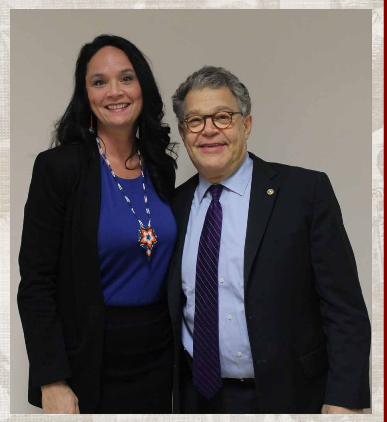
"We deeply appreciate and thank Senator Al Franken (MN). He has worked in partnership with our coalition and Indian tribes to address and increase the safety of Native women in Minnesota"

Miigwetch Bizidawiyeg! Thank you all for listening!