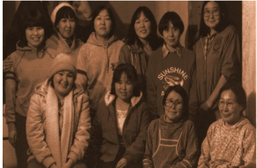
Emmonak Women's Shelter