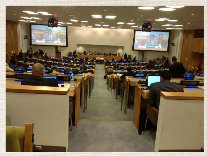
UNITED NATIONS WORLD CONFERENCE ON INDIGENOUS PEOPLES

organizations in the United States, and supported by resolutions of the National Congress of American Indians and the Assembly of First Nations.