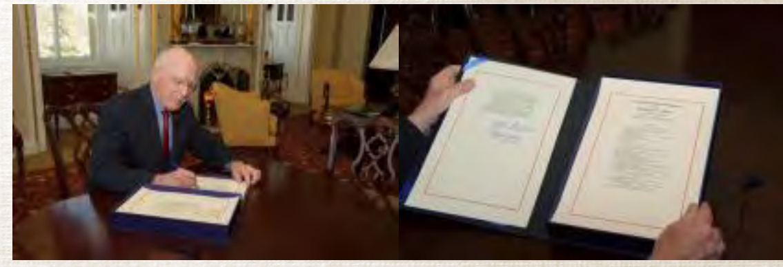
Left: In his role as President pro tempore of the Senate, Senator Leahy signed the Violence Against Women Act reauthorization in his office in the Capitol building. Right: The Violence Against Women Act reauthorization with Senator Leahy's signature on the bill as President pro tempore.

A key provision in the Leahy-Crapo bill, now law, recognizes tribes' special domestic violence criminal jurisdiction to prosecute non-Indian offenders who commit acts of domestic violence against an Indian on tribal land. This provision also faced strong opposition by some but we held firm in the belief that a tribal government should be able to hold accountable those who commit these heinous crimes against its people on its land. I was so proud when voices from around the country—Indian and non-Indian—joined our